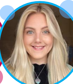
Cara School Liaison Officer